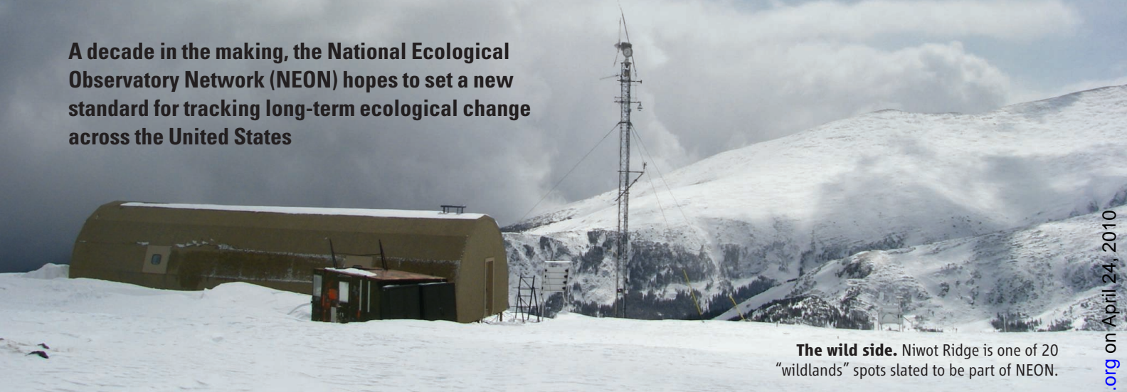
The wild side. Niwot Ridge is one of 20 “wildlands” spots slated to be part of NEON.

A decade in the making, the National Ecological Observatory Network (NEON) hopes to set a new standard for tracking long-term ecological change across the United States