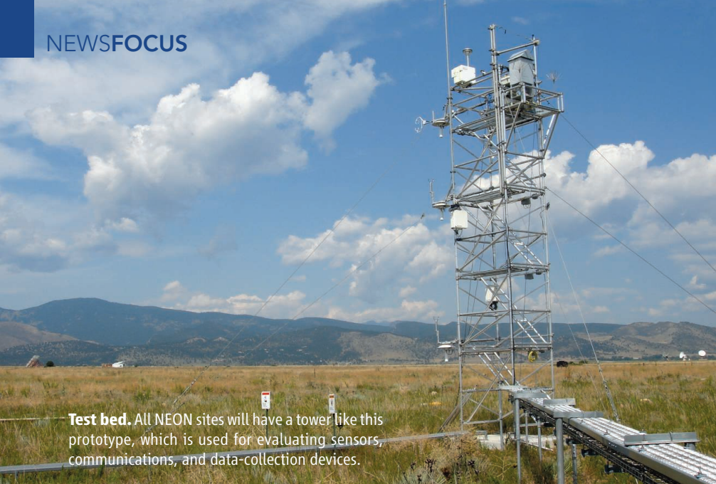
Test bed. All NEON sites will have a tower like this prototype, which is used for evaluating sensors, communications, and data-collection devices.

planes will also carry cameras and lidar to measure forest canopy heights and biomass.